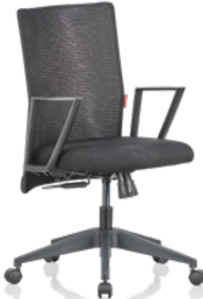
Contact Project MB FA (Fixed Arm)