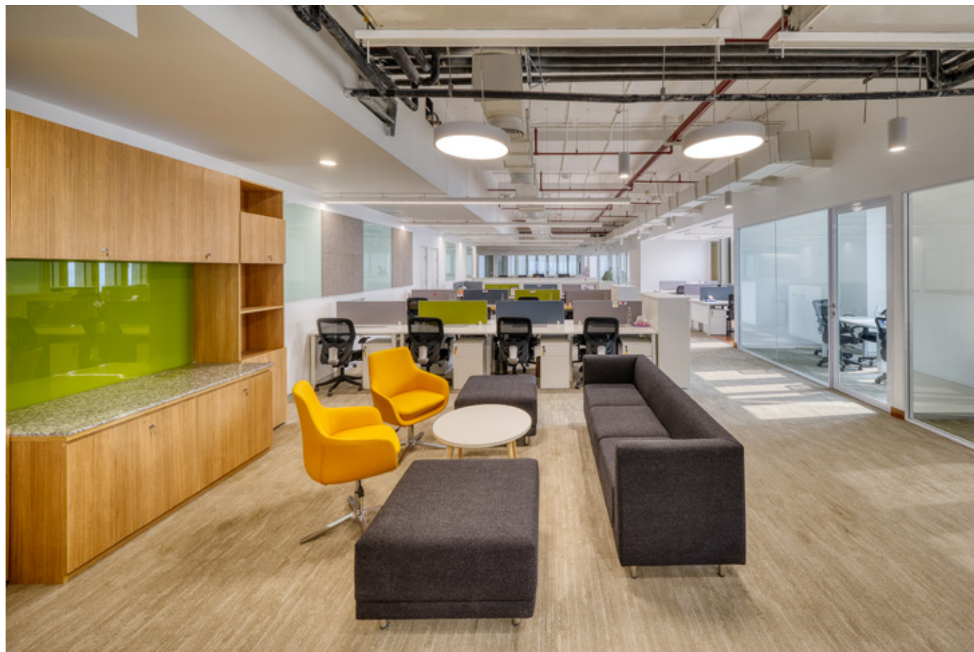
Site : Kama Ayurveda, Delhi | Products : Lounge Series Chairs and Sofas

Different areas in an office serve a different purpose. In the modern office space plans there are in-between spaces where people might relax, unwind, have a casual chat or prepare for a meeting. This is where our collection of soft seating comes in. This collection consists of upholstered furniture with soft cushions to facilitate comfortable seating and an informal and positive work atmosphere. Stylish, sturdy yet creatively designed these chairs do the perfect job at creating a balance of professional communications and comfortable discussions.