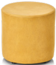
Cylvia Pouffe Ø 400 x H 385