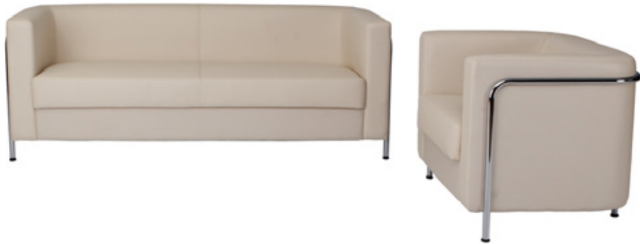
Pearl (Leatherette/ Fabric) 1 Seater: 780 (W) x 725 (D) X 700 (H) 2 Seater: 1275 (W) x 725 (D) X 700 (H) 3 Seater: 1800 (W) x 725 (D) X 700 (H)