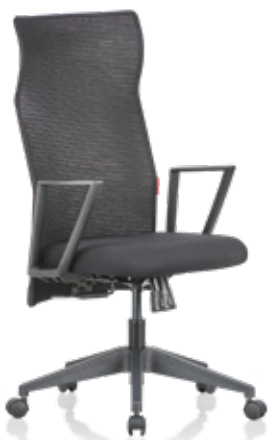
Contact Project HB FA