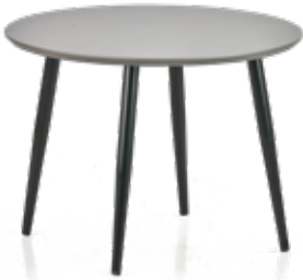
Dark Grey Round Corner Table