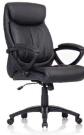
CS 676 - E - HB Leatherette