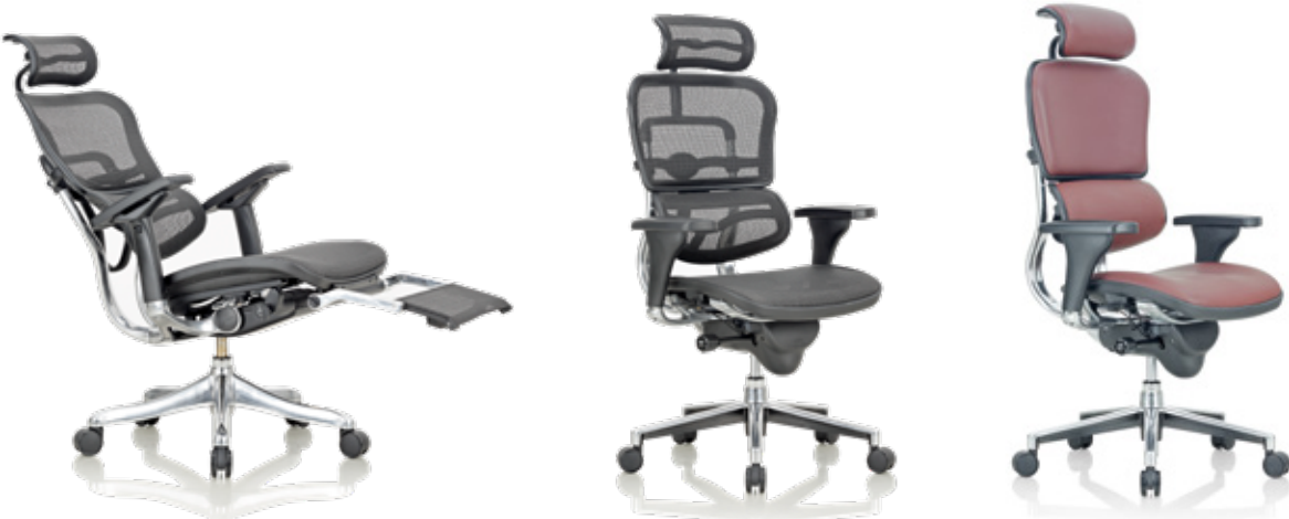
Pinnacle Mesh-FR (Foot Rest) EHPE-AB-HAM-LM Pinnacle Mesh (EHS-HAM) Pinnacle Leather (EHS-HAL)