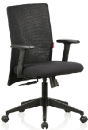
Contact Project MB