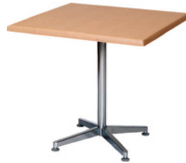
Cafe Chrome ISO Top: W 800 x D 800 x H 740 PLB Top: W 800 x D 800 x H 740 PLB colours from our standard shade card