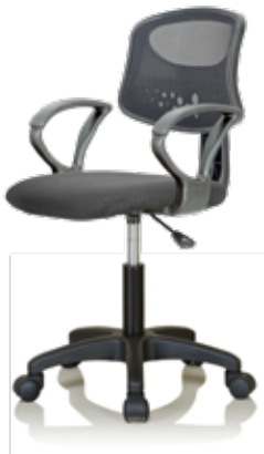
Student With & Without Arms