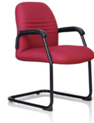
Bodyline Visitor VA1