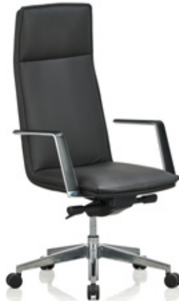
Pixel HB Leatherette & Half Leather