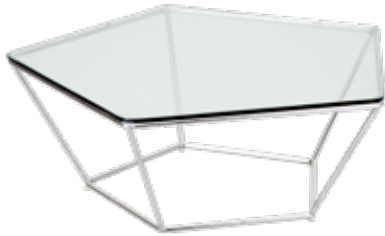
BC0015 Large: 650 X 650 X 650 X 650 X 650 X 400 (H) Small: 400 X 400 X 400 X 400 X 400 X 450 (H)