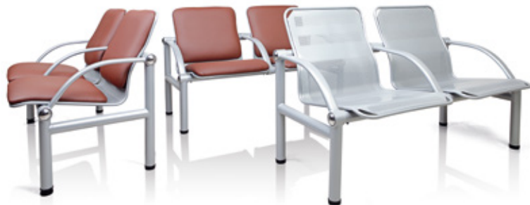
Brune Tandem 2 & 3 Seater Cushion [ MOQ - 4 Qty ]