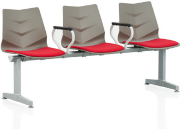
3 & 2 Seater Leaf Tandem Cushion Seat With & Without Arms