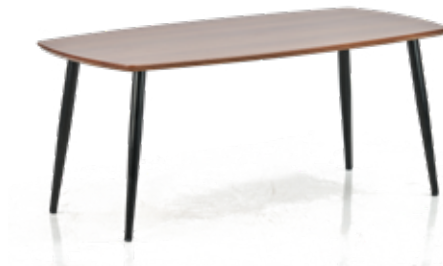
Walnut Rectangular Centre Table