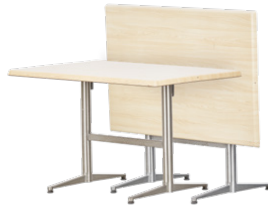
Cafe Fol - SS Legs ISO Top: W 1200 x D 800 x H 740