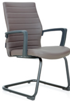
Bravo Visitor Leatherette