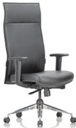
FP Invention HB Leatherette & Half Leather