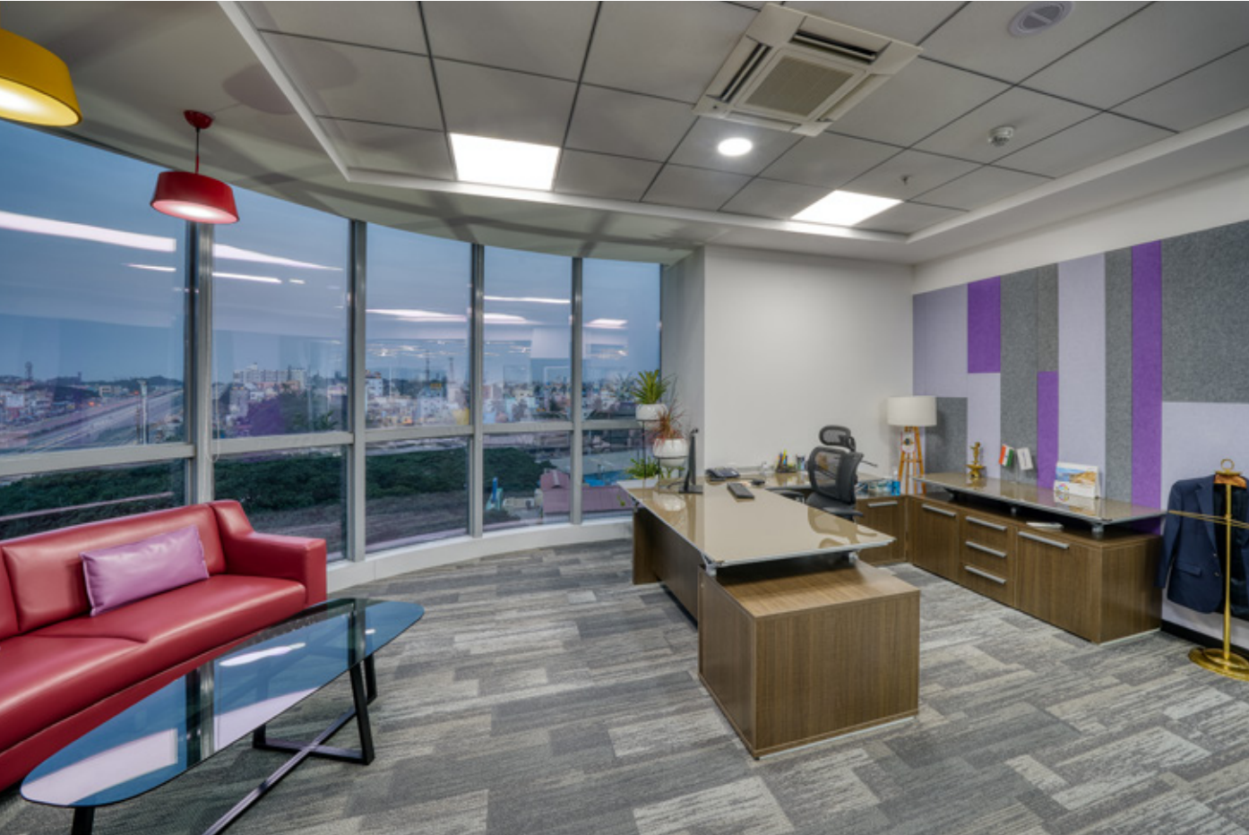
Site : WSAudiology, Bangalore | Products : Signature Series Table with Pinnacle Chair

Consider the boss' chair, a mute object. You may think, an insignificant agglomeration of steel springs and upholstery - only a spot to sit. Indeed, the seat picked by top officials is significantly more than that. It is a totem, an image of intensity, and it anticipates a charming, if subliminal, message. The C.E.O.'s chair is a very powerful tool for managing the impressions of visitors. It exemplifies personal style. Does it say hierarchy, or does it create the illusion of equality? Either way, the chair's symbolism is key. Our executive chairs are designed to exhibit seating that offer unparalleled levels of comfort and support. Most of these products of engineered working comfort are made in a range of models for all of the employees in the corporate empire - from the data processors to the C.E.O so that one doesn't have to divine from the height of the back or the richness of the upholstery who the ultimate occupant might be.