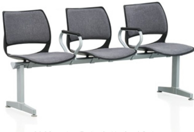
3 & 2 Seater Loop Tandem Cushion Seat & Back With & Without Arms