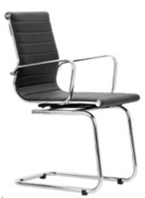
Chrome S0203 Visitor Leatherette