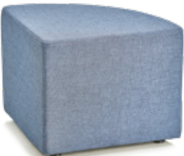
Quart de Pouffe W 620 x D 450 x H 385