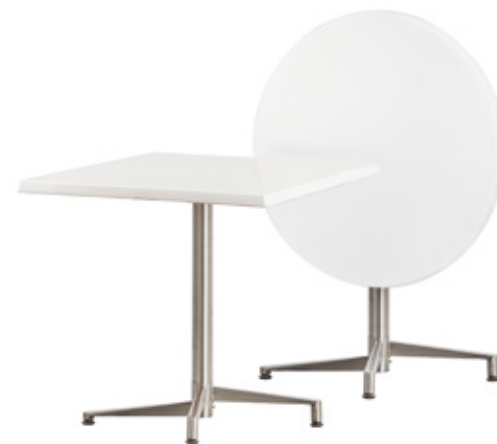
Cafe Fold - SS Legs ISO Top: W 800 x D 800 x H 720