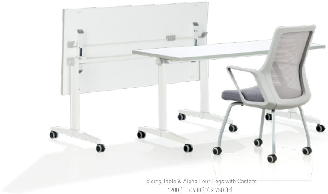
Folding Table & Alpha Four Legs with Castors 1200 (L) x 600 (D) x 750 (H)