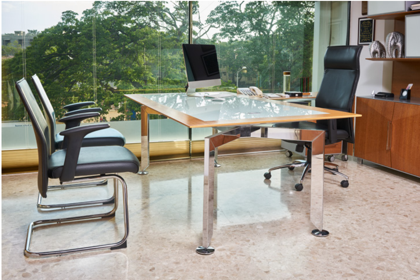
Site : Featherlite Head Office, Bangalore | Product : Invention visitor and high back chairs

First impression is the last impression” and we help you make that absolute great first impression. Our office visitor chairs promise incredible looks and comfort. They not only compliment the professional look of your workplace but also provide a warm and welcoming environment. We make best reception area seating furniture for visitors. Besides providing high levels of comfort, the high quality build and material give these chairs a sleek look and feel.