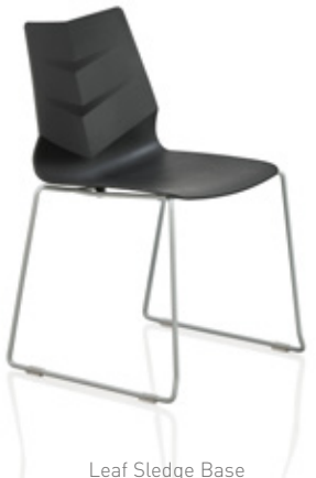
Leaf Sledge Base