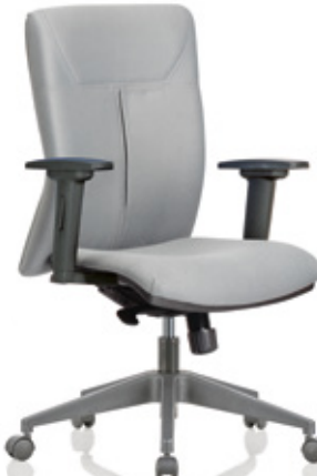
Click MB Leatherette Fabric / Leatherette