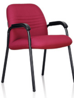
Bodyline Visitor VA2