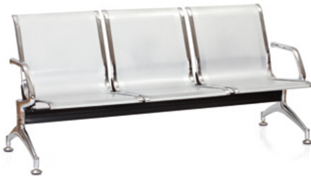
Sleek Metal Tandem SJ-820-2 & 3 Seater