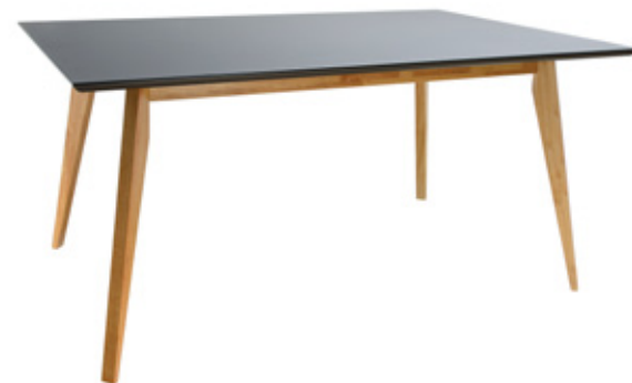
Woodrow Cafe - Solid wood Leg W 1600 x D 1000 x H 750