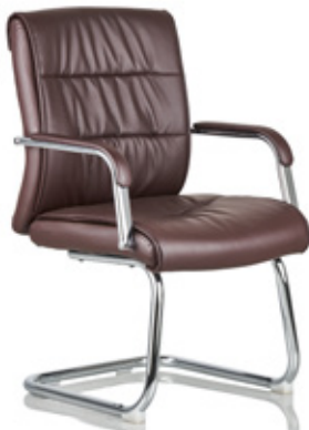
Tycoon Visitor Leatherette