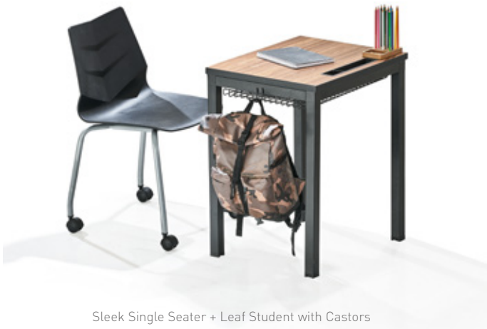
Sleek Single Seater + Leaf Student with Castors 625 (L) x 500 (D) x 750 (H)