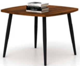
Walnut Square Corner Table