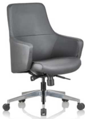
Indigo MB Leatherette & Half Leather