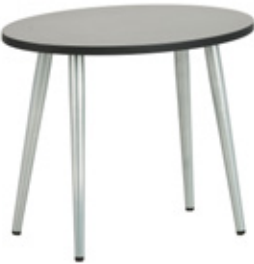
Dark Grey Oval Side Table