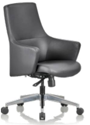
Indigo Aluminium MB Half Leather / Leatherette