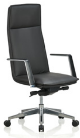
Pixel HB Leatherette & Half Leather