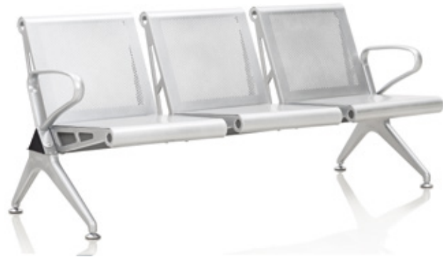
Sturdy Metal Tandem SJ-708 L - 3 Seater