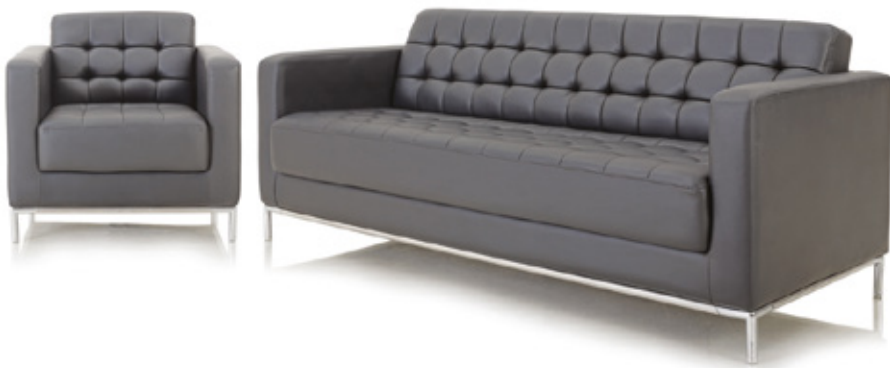
Interact: S-902 (Leatherette/ Fabric) 1 Seater: 750 (W) x 710 (D) X 780 (H) 2 Seater: 1275 (W) x 710 (D) X 780 (H) 3 Seater: 1800 (W) x 710 (D) X 780 (H)