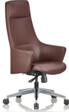
Indigo HB Leatherette & Half Leather