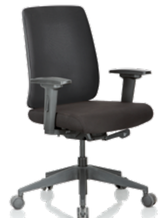
Versa Cushion MB