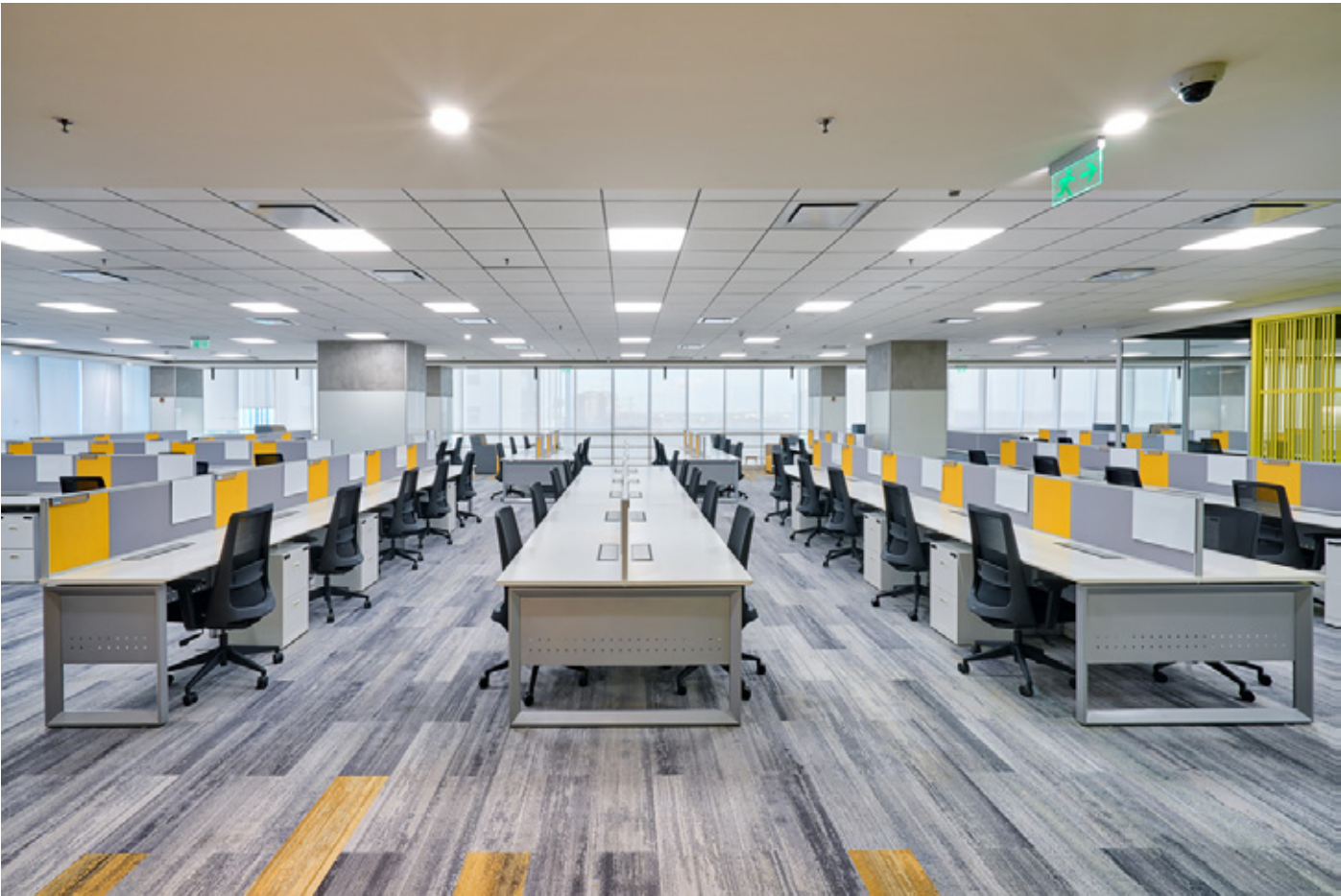
Site : DXC, Bangalore | Products : Collaborate Workstation with Amaze Chairs

Our Task Seating collection symbolize efficiency and productivity through ergonomic design. With the way we work changing every day, the average working employee has needs both physical and physiological that will help him or her perform optimally while maintaining a healthy posture. Equipped with highly adjustable components our task chairs will make work feel easy for you. Make changes to your arm rest height, seat height or your lumbar support, all while you are seated. While the chair focuses on comfort and style, we have laid special focus on the design to foster collaboration among employees through innovative and contemporary looks brought to life with superior quality materials.