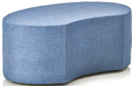
Duo Pouffe W 1000 x D 500 x H 395