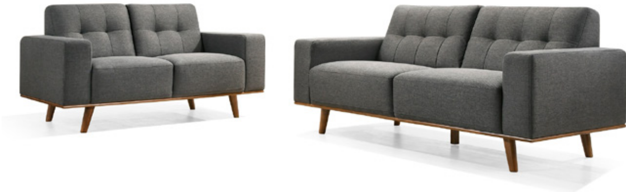
E007 2 Seater: 1655 (W) x 1000 (D) x 880 (H) 3 Seater: 2210 (W) x 1000 (D) x 880 (H)