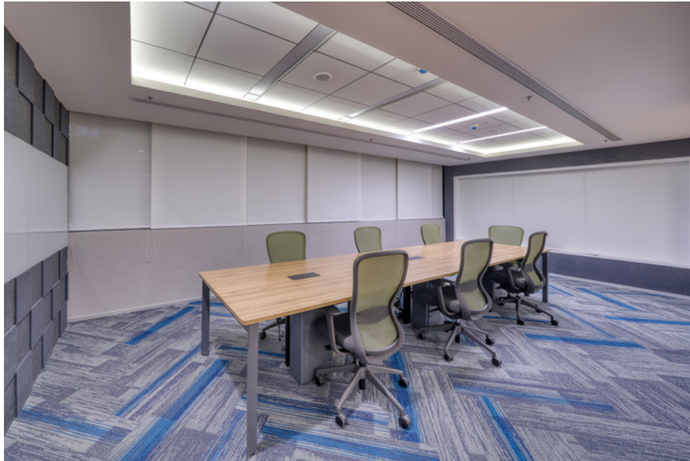
Site : Alcon, Bangalore | Product : Collaborate Conference Table with Helix MB Chairs

About 51% of workers globally are disengaged during office hours, out of which 17% are actively disengaged. Boards Rooms are focus points that require its attendees to be engaged for lengthy durations of time without losing focus. It is a space in the office where important decisions are made through collaboration of minds. Stay focused during meetings and conferences with our board room seating. This collection is designed to be stylish and comfortable for team settings and foster collaboration. Perform, contribute and collaborate to your fullest potential with our board room seating.