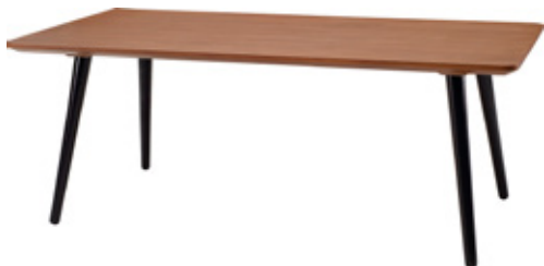
Carsyn Centre Table 1200 (W) X 600 (D) X 470 (H)