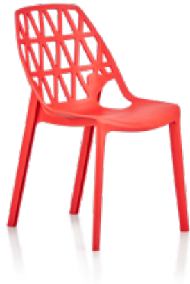
Tang □ ■ ■ ■ ■ ■