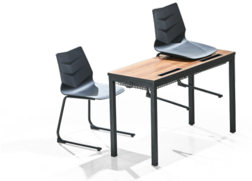
Sleek 2 Seater + Leaf Student 1200 (L) x 500 (D) x 750 (H)