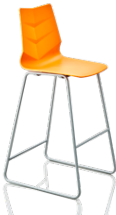
Leaf bar stool