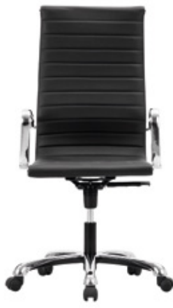
Chrome S0201-HB Leatherette