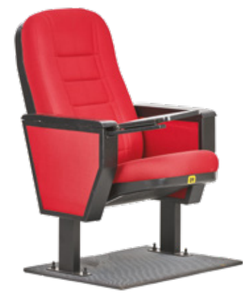
Venus 6604 WD with Writing Desk