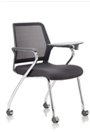
Forum 4-Legs With WD (With/ Wihtout Castors)