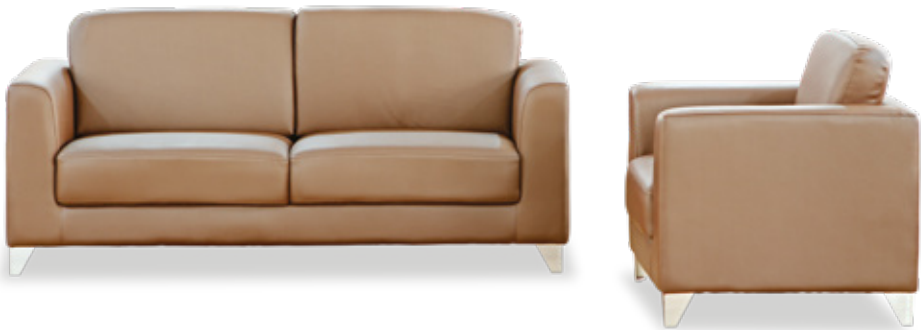
Converse: S 900 (Leatherette/ Fabric) 1 Seater: 875 (W) x 750 (D) X 820 (H) 2 Seater: 1375 (W) x 750 (D) X 820 (H) 3 Seater: 1900 (W) x 750 (D) X 820 (H)