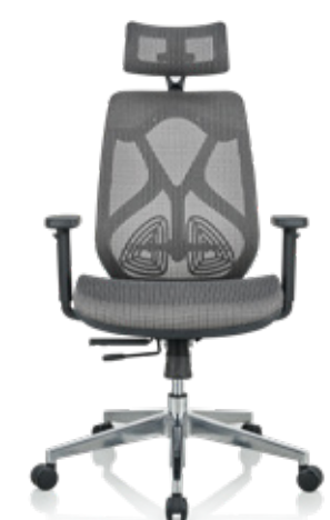
X-3 YS0817H (E+EW)