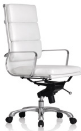
Chrome YS 6040 C (Padded) Leatherette HB