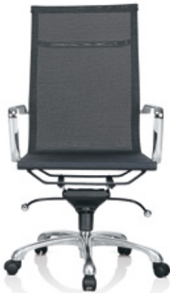
Chrome YS 6010