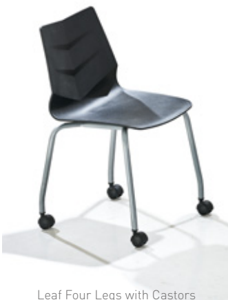
Leaf Four Legs with Castors