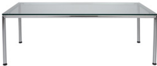
Verve Glass Centre Table 610-FL 1200 (W) X 600 (D) X 425 (H)