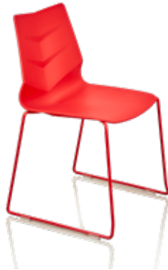
Leaf sledge base