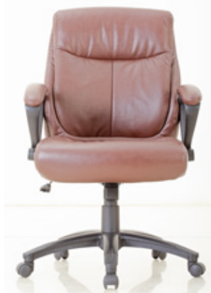
Tycoon CS 676 - MB Leatherette

Featherlite's series of board room chairs are renowned and the best in India, thanks to the comfortable, sturdy yet aesthetic designs. A wide & luxurious choice of board room chairs cover all types and needs for a seating arrangement.