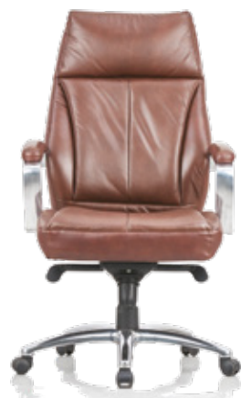
CS 6031E- HB Half Leather