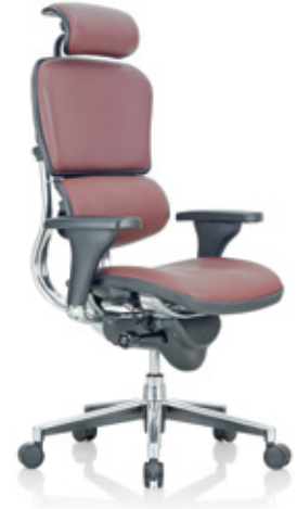
Pinnacle Full Leather / Mesh (EHS-HAL)