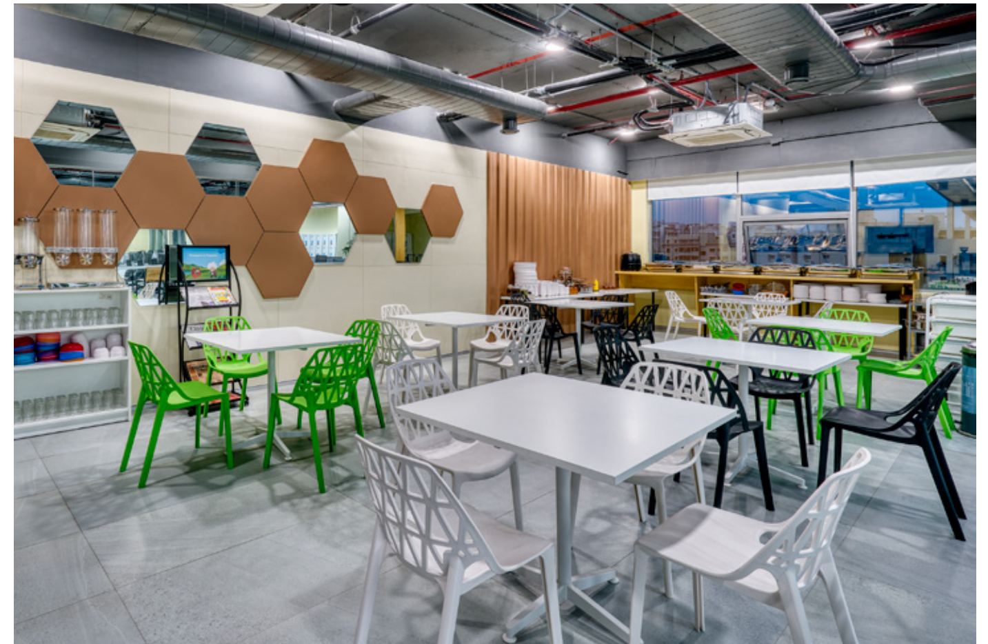
Site : Salesforce, Hyderabad | Products : Tang Chairs with Cafe Tables

A quick bite or a long break, our Cafeteria/Casual Seating range complement the hangout needs of all at the academy. Sit down for a long round of chatting, an unofficial meeting, discussing work, or even an academic event planning while lunching with your peers. What's more, there is no fuss, cleaning the mess, thanks to the stain free materials this range is made of. Some of these chairs are stackable, washable if there were any spills, readily available to arrange and use and available in an assortment of colours.