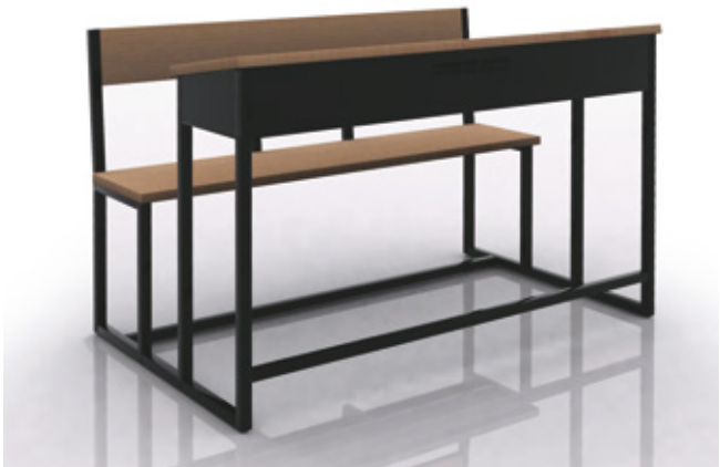
Square Tube Bench - 2/3 Seater 2 Seater - 1200 (L) x 900 (D) x 720 (H) | 3 Seater - 1800 (L) x 900 (D) x 720 (H)