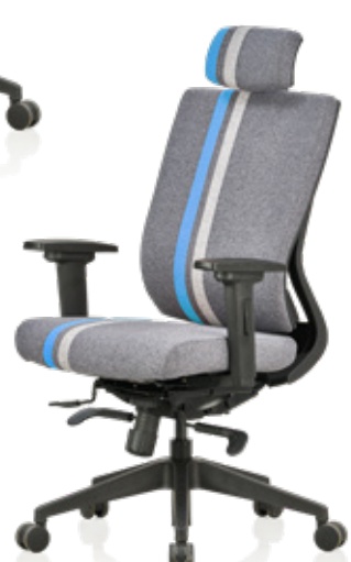
Liberate Game Blue