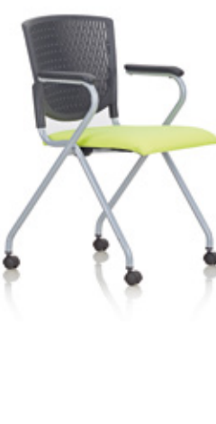
Magna Flip with WD