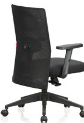
Contact Project MB with Lumbar Support