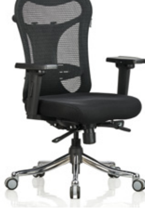
FP Optima MB