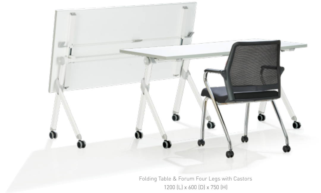
Folding Table & Forum Four Legs with Castors 1200 (L) x 600 (D) x 750 (H)

2 Seater - Front Row: 1250 (L) x 500 (D) x 800 (H) | Mid Row: 1250 (L) x 910 (D) x 800 (H) | Last Row: 1250 (L) x 650 (D) x 800 (H) 3 Seater - Front Row: 1785 (L) x 500 (D) x 800 (H) | Mid Row: 1785 (L) x 910 (D) x 800 (H) | Last Row: 1785 (L) x 650 (D) x 800 (H)