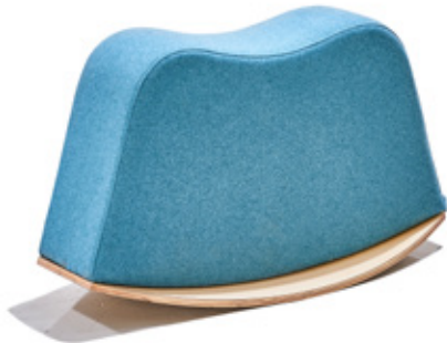
Saddle W 800 x D 400 x H 500