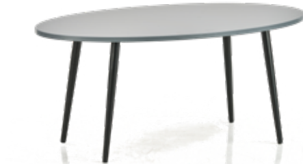
Dark Grey Oval Centre Table