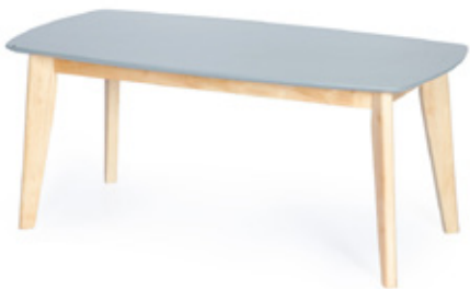
Arthur Centre Table 1005 (W) X 520 (D) X 450 (H)