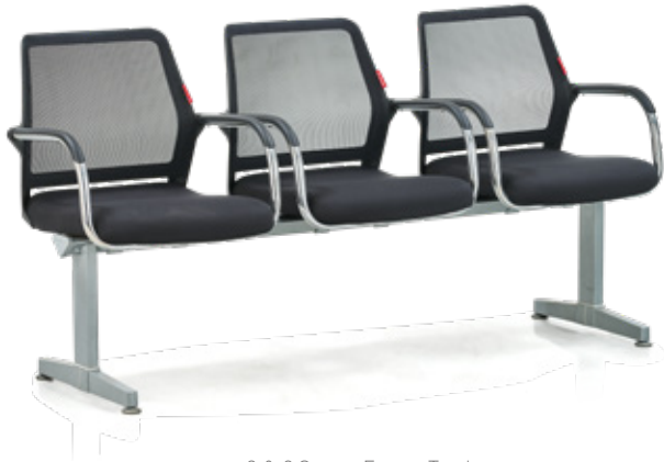
3 & 2 Seater Forum Tandem Free Standing

We give great emphasis on advanced design concepts to meet the wide ranging demands of public seating. We understand that space is a precious and finite resource. So, while designing your creative seating systems with style and durability we make sure to utilize the maximum advantage of space to provide you the perfect options for interior or exterior seating. Our experience in design, planning, engineering and manufacturing allows us to provide holistic expertise to public seating ideas and develop products and services that are connected and comprehensive.