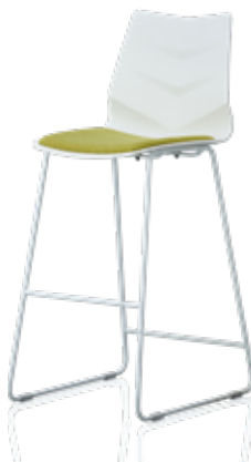
Leaf cushion bar stool □ ■ ■ ■ ■