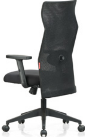
Contact Project HB with Lumbar Support