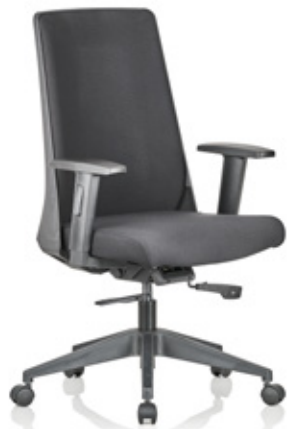
Amaze Cushion Back