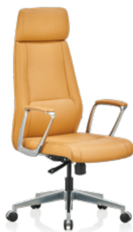
Yoma HB Half Leather