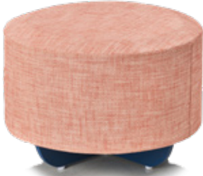
Circa Pouffe Ø 635 x H 440