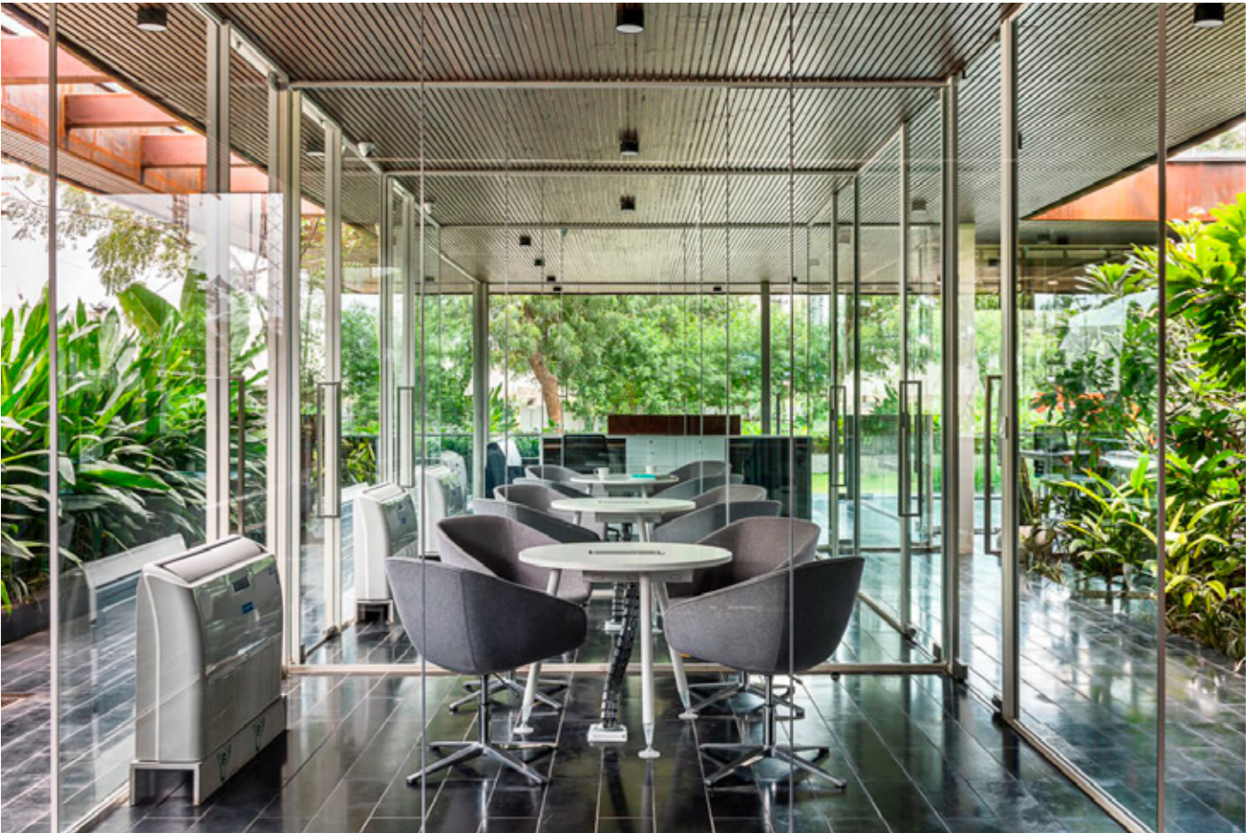
Site : Sunshine Developers, Hyderabad | Product : Connect Discussion Table with Clara Chairs

Our Conference/Discussion Seating collection comprise of furniture for collaboration and communication in a variety of settings and compositions. These are areas for spontaneous collaboration, stand-up meetings, seminar and presentation spaces, workshops and discussions in small, informal settings. In a knowledge society, team performance beats individual achievement. People see and meet each other – knowledge transfer and creation is only possible when we are communicating with each other. Spaces for meetings and conferences are places of modern productivity. A functional portfolio of chairs like our Conference/Discussion Seating is needed to furnish these communicative areas.