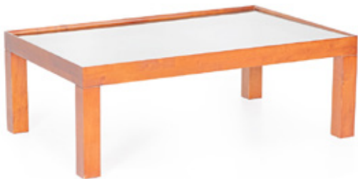
Clarkson Centre Table: 1200 (W) X 770 (D) X 330 (H) Side Table: 450 (W) X 450 (D) X 530 (H)