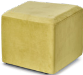
Cube Pouffe W 410 x D 390 x H 385