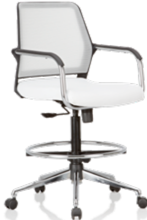
Forum Teller Base Available with Regular Base