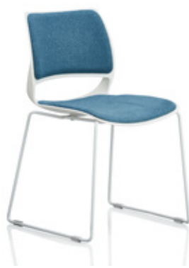
Loop cushion seat & Back