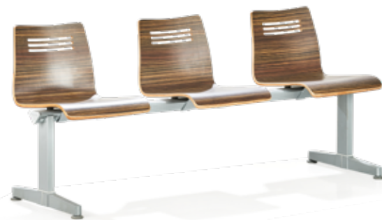
3 Seater Zella Tandem With & Without Arms