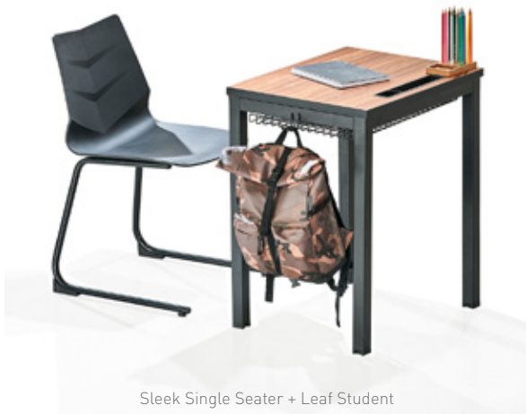
Sleek Single Seater + Leaf Student 625 (L) x 500 (D) x 750 (H)