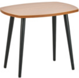
Walnut Rectangular Side Table