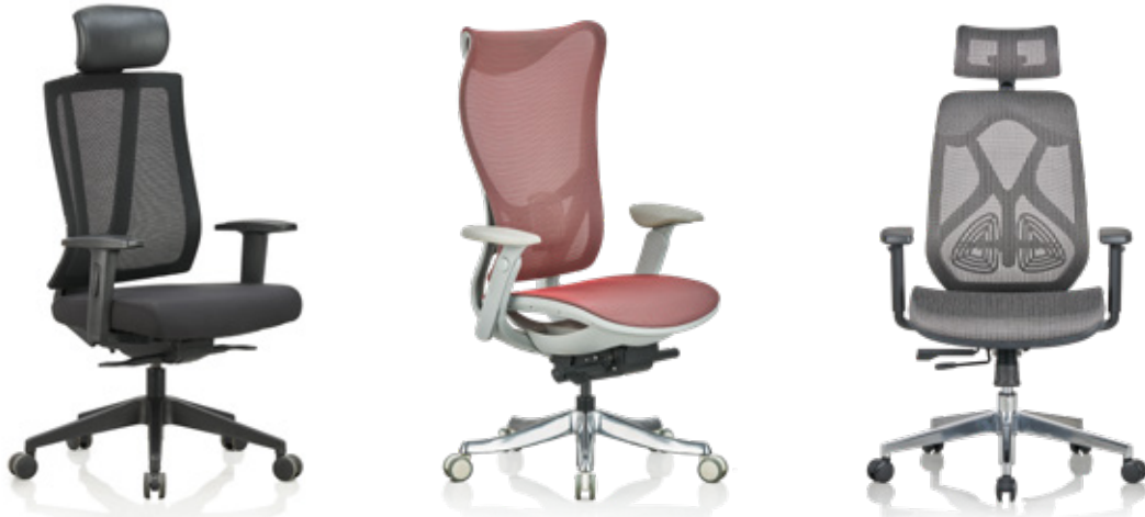
Enzo HB Flamingo X-3 YS0817H (E+EW)