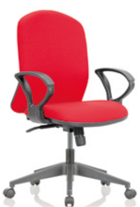
Telemate MB ( MOQ - 50 )