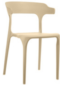
Sand (P-132) ■ ■