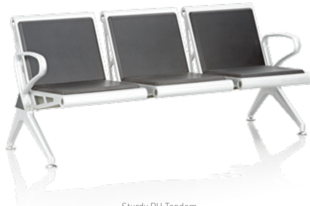
Sturdy PU Tandem SJ - 708 LA - 3 Seater