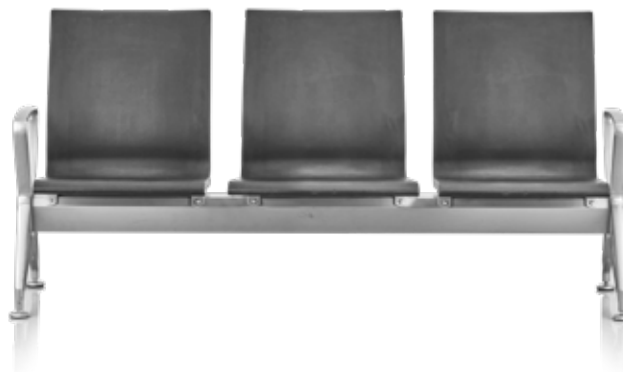
Aluminium PU Tandem SJ - 9075 - 3 Seater