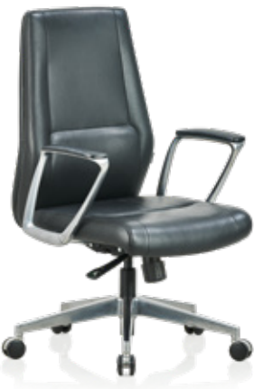
Yoma MB Touch Leather