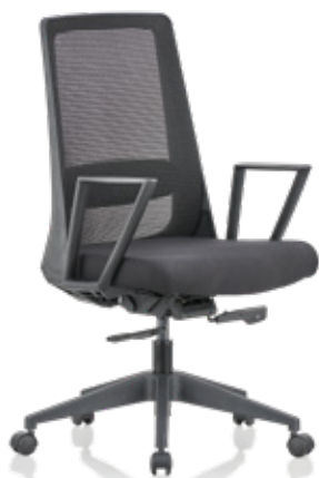
Amaze FA (Fixed Arm)