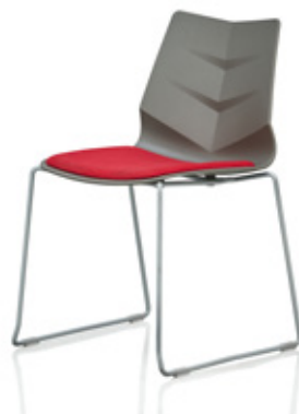
Leaf cushion seat