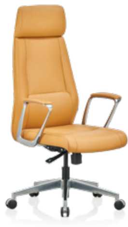
Yoma HB Half Leather