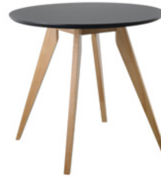
Woodrow Cafe - Solid wood Leg Ø800 x H 750