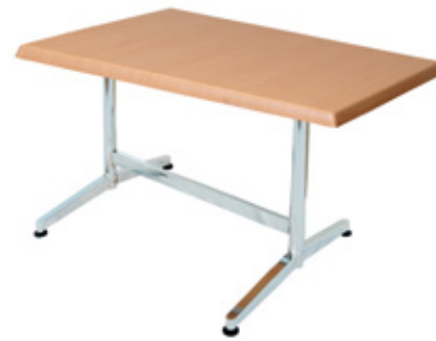
Cafe Chrome ISO Top: W 1200, 1500, 1800 x D 800 x H 740 PLB Top: W 1200, 1500, 1800 x D 800 x H 740