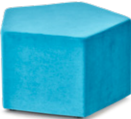
Penta Pouffe W 590 x D 570 x H 385