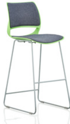
Loop cushion bar stool