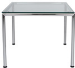
Verve Glass Side Table 610-FS 600 (W) X 600 (D) X 505 (H)