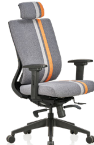
Liberate Game Orange