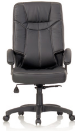
HF 366 HB Leatherette