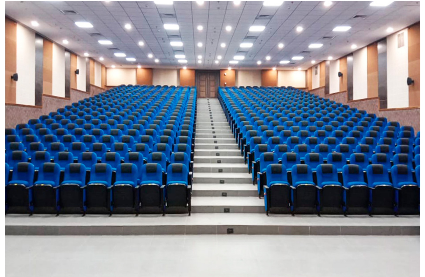
Site : Siksha-o-Anusandhan College, Bhubaneswar | Product : Venus

The Genius chair is easily movable and stackable – a quality that translates directly into classroom performance After all, a lesson plan can be carried out more effectively when seating is arranged and rearranged effortlessly.