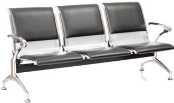
Sleek Cushion Tandem SJ-820A-2 & 3 Seater