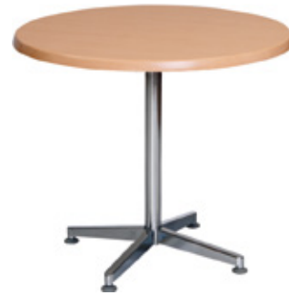
Cafe Chrome ISO Top: 914 Ø x H 740 PLB Top: 914 Ø x H 740