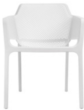
Air (P-131) □ ■