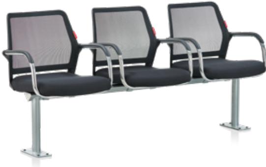
3 & 2 Seater Forum Tandem Grouted