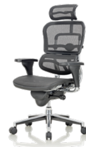
Pinnacle Mesh (EHS-HAM)