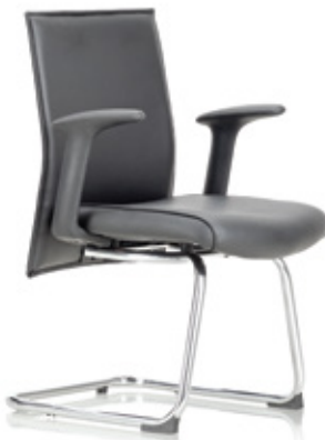
Invention Visitor PU Arms Leatherette