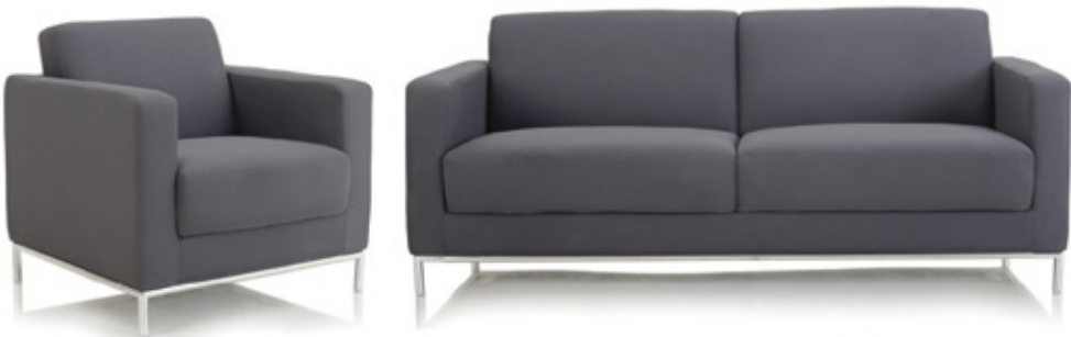
Indulge: S-906 E (Leatherette/ Fabric) 1 Seater: 770 (W) x 710 (D) X 780 (H) 2 Seater: 770 (W) x 710 (D) X 780 (H) 3 Seater: 1800 (W) x 710 (D) X 780 (H)