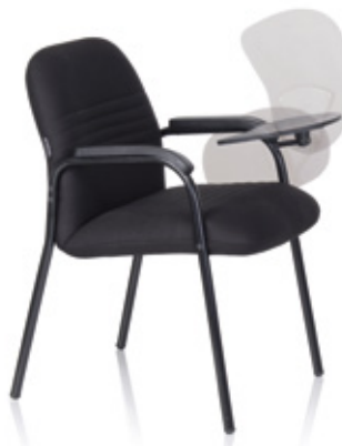
Bodyline VA WD