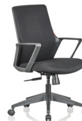
Alpha Cushion MB