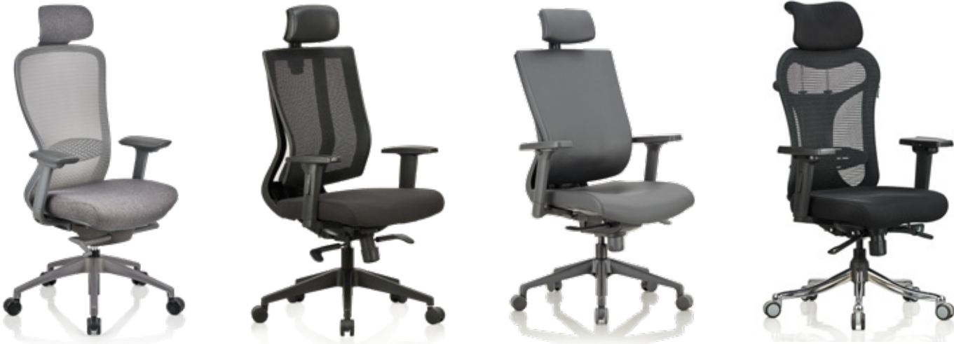
Helix HB Liberate HB Liberate Leatherette Optima HB

Consider the boss' chair, a mute object. You may think, an insignificant agglomeration of steel springs and upholstery - only a spot to sit. Indeed, the seat picked by top officials is significantly more than that. It is a totem, an image of intensity, and it anticipates a charming, if subliminal, message. The C.E.O.'s chair is a very powerful tool for managing the impressions of visitors. It exemplifies personal style. Does it say hierarchy, or does it create the illusion of equality? Either way, the chair's symbolism is key. Our executive chairs are designed to exhibit seating that offer unparalleled levels of comfort and support. Most of these products of engineered working comfort are made in a range of models for all of the employees in the corporate empire - from the data processors to the C.E.O so that one doesn't have to divine from the height of the back or the richness of the upholstery who the ultimate occupant might be.