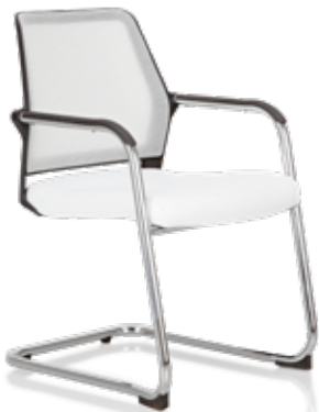
Forum Visitor Sledge Base