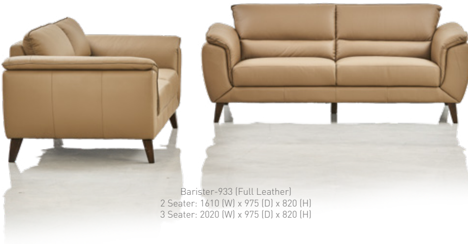
Barister-933 (Full Leather) 2 Seater: 1610 (W) x 975 (D) x 820 (H) 3 Seater: 2020 (W) x 975 (D) x 820 (H)