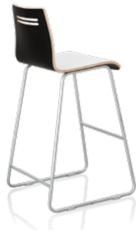
Zella Stool 4 □ ■ ■ ■