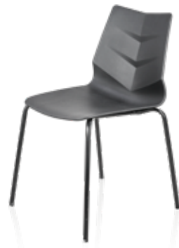
Leaf 4 legs