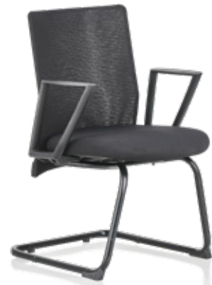
Contact Project Visitor

First impression is the last impression” and we help you make that absolute great first impression. Our office visitor chairs promise incredible looks and comfort. They not only compliment the professional look of your workplace but also provide a warm and welcoming environment. We make best reception area seating furniture for visitors. Besides providing high levels of comfort, the high quality build and material give these chairs a sleek look and feel.