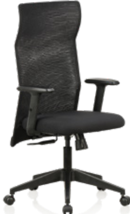
Contact Project HB