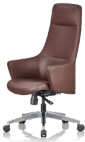
Indigo HB (ALR 4P) Leatherette & Half Leather