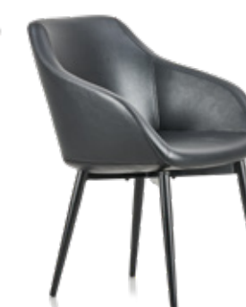
Costa 4 Legs